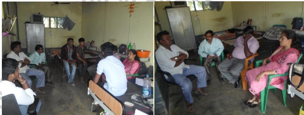
Discussion with APD staff and Association Staff.