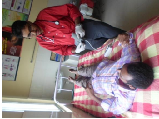
doctor checking the BP,sugar level