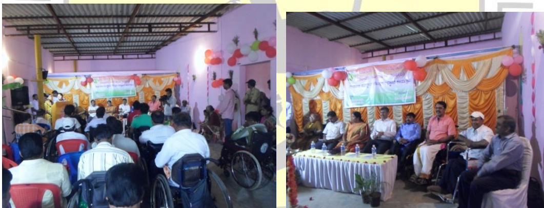
New SRC Inauguration time