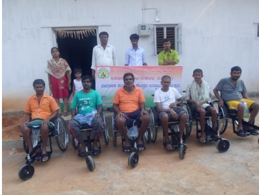
Wheel chair distribution to PWSCIs