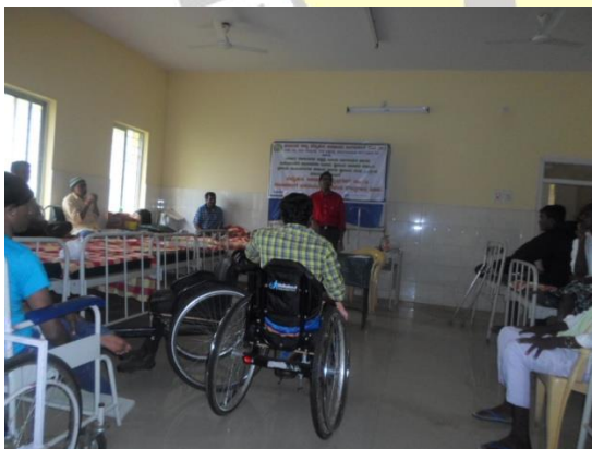
Doctors give Information about SCI.