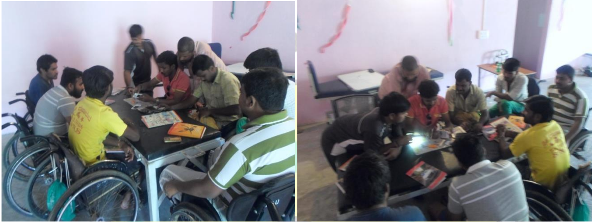
During Mobile training class