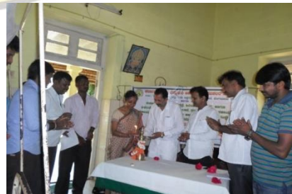
Camp Inauguration Time chief Guests Lightening the Lamp