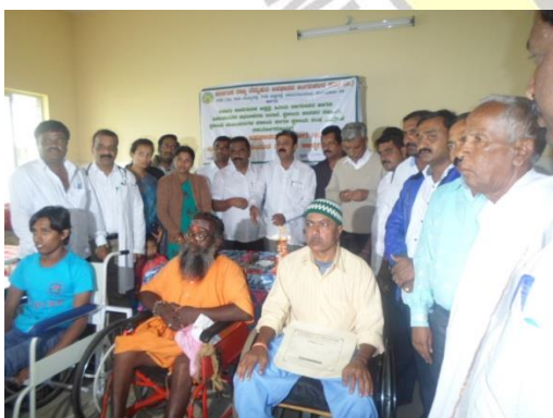
Inauguration time with local MLA, THO doctor and Association secretary.