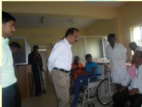
THO doctor visit and discuss with SCI persons.