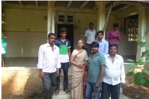
Group Photo at the end of the Day.