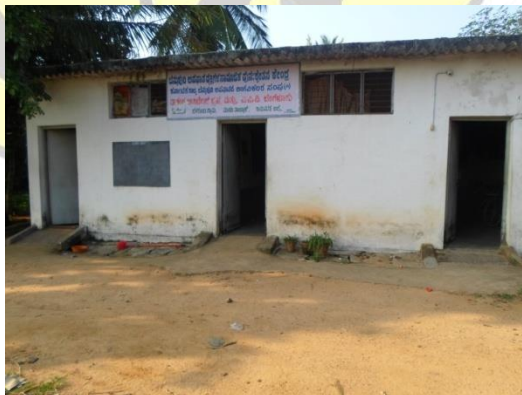
Over view of Social Rehabilitation at Torepalya (v) Magadi (Tq) Ramnagara (Dist)