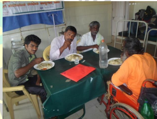
lunch time at camp