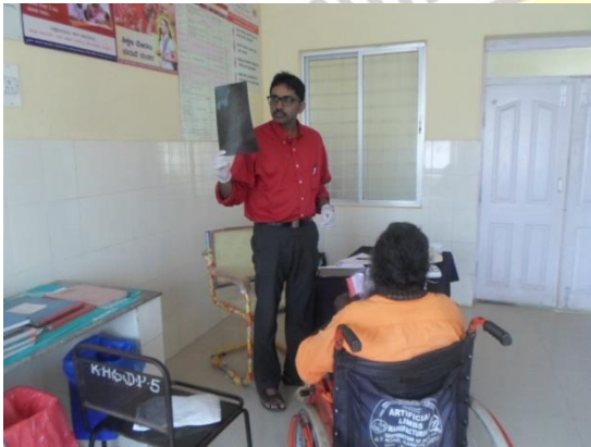
Doctor checking clients reports