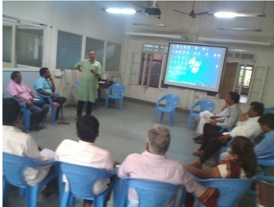
Organizational key elements