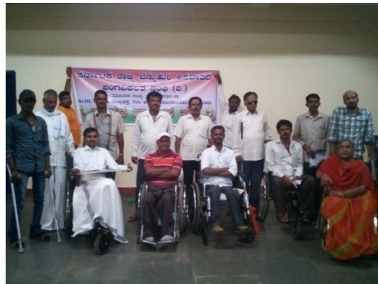
New Board members of 2015-2016.