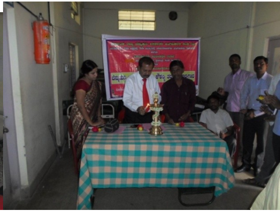
Camp Inauguration by