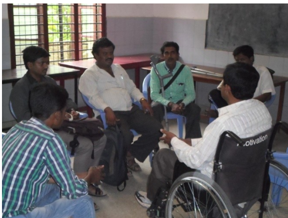
FG: 20: Board members meeting at APD