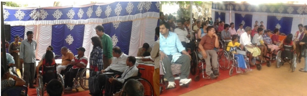
Doctors discuss with the clients at the Camp.