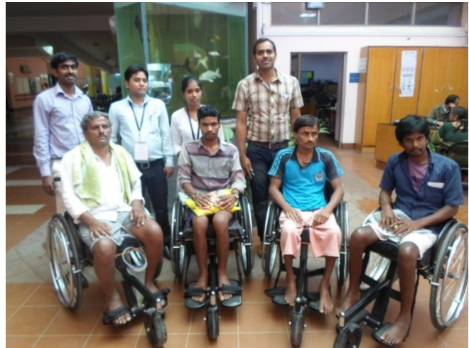
Wheel chair Distribution clients.