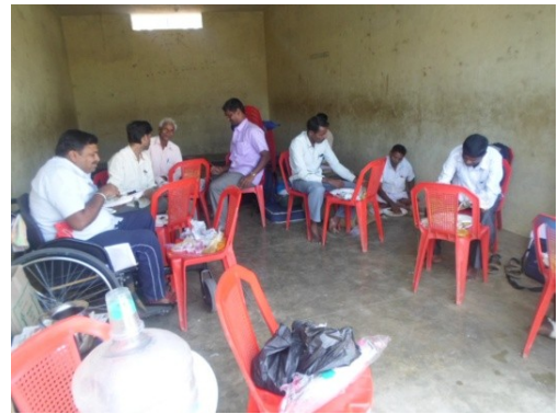
lunch time at