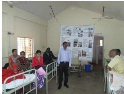
Palswamy sir presenting SCI.