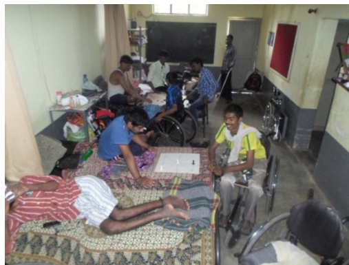
Recreational Games For inmates.