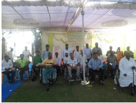
Movement of Wheel chair distributio