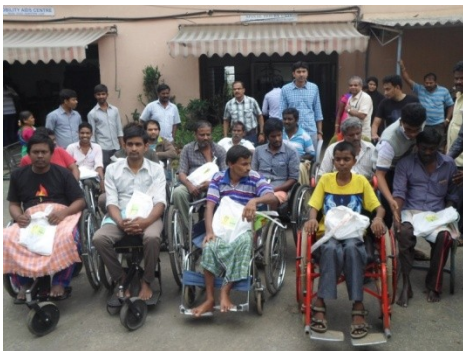
Medical Kit distribution camp at APD