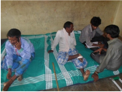
Assessment done By Therapists. Guests and ceremony.