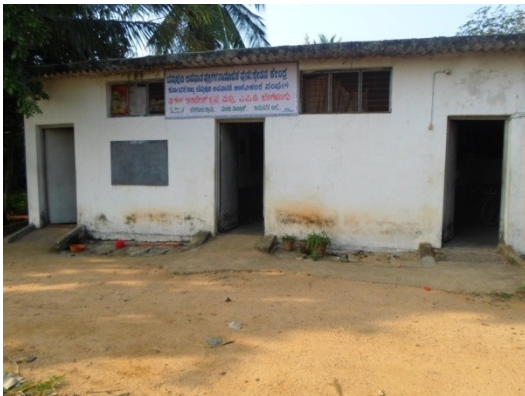
Over view of Social Rehabilitation at Torepalya (v) Magadi (Tq) Ramnagara (Dist)