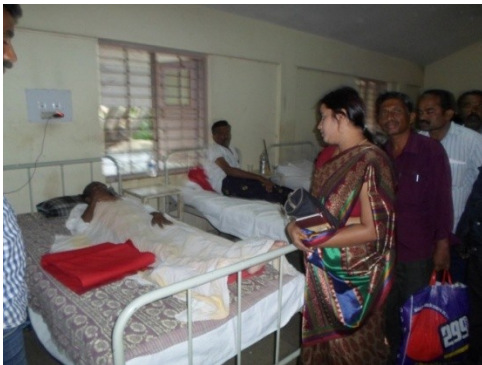
CDPO madam discusses with clients information.