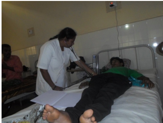
B.P level checking by health Assistant