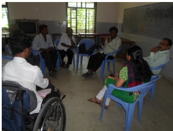
Review Meeting with APD staff and Association Staff and Board members.