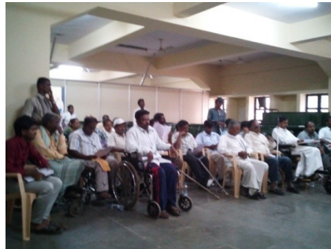
Members of the KRBAAS.