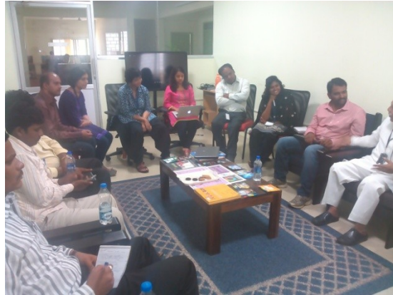
leaders visited the Enable