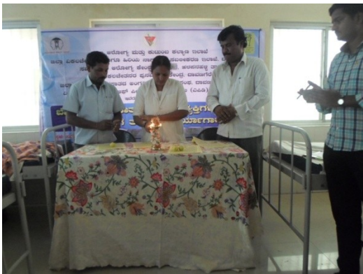
Camp Inauguration Ceremony Assistant